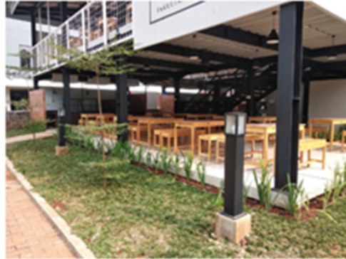
Two canteens in the Faculty of Psychology that use less electricity