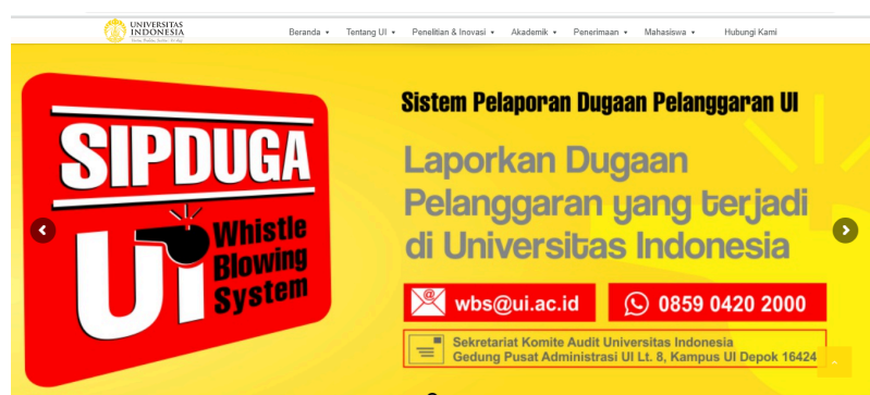
Whistle Blowing System Universitas Indonesia (WBS UI)